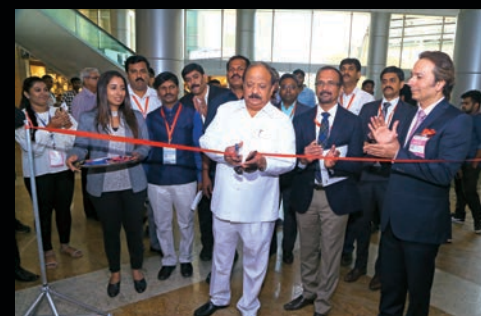
R Roshan Baig inaugurating the Smart Cities Expo that included more than 150 exhibitors.

While the welcome address was delivered by Pratap Padode, Founder & Executive Director, Smart Cities Council India; R Roshan Baig, Minister for Infrastructure, Urban