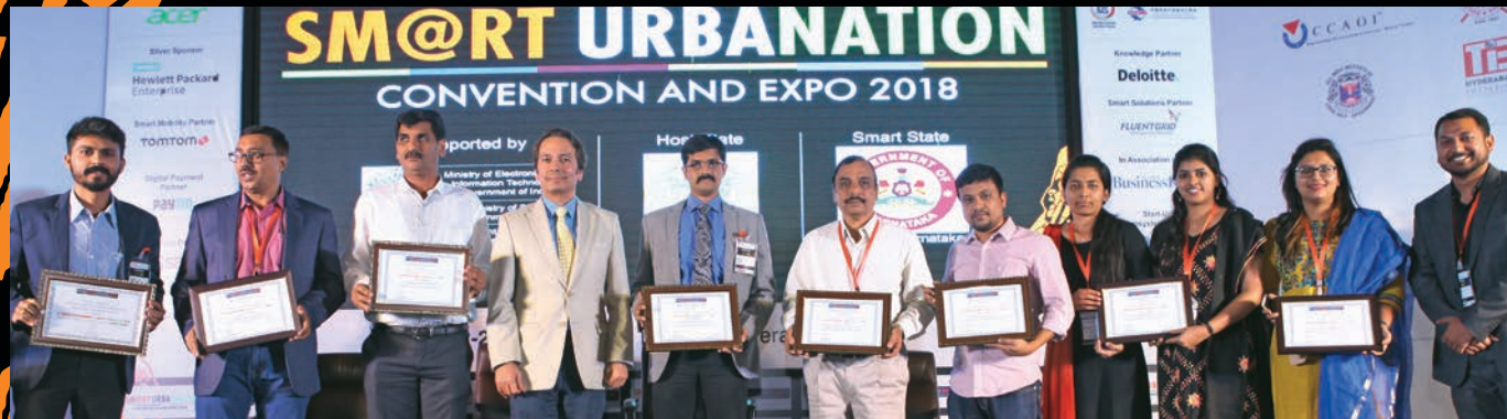
(L-R) Karnataka Urban Infrastructure Development and Finance Corporation team receiving the certificate for being a partner – Smart State – for the summit; cities under the AMRUT mission – Hubballi-Dharwad, Mangalore, Shivamogga, Tumakuru, Belagavi, Bengaluru, Davanagere and Bijapur – in the state were also felicitated.