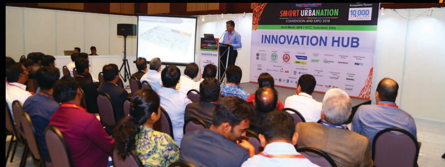
The Innovation Hub witnessed 40+ start-up solution demonstrations.